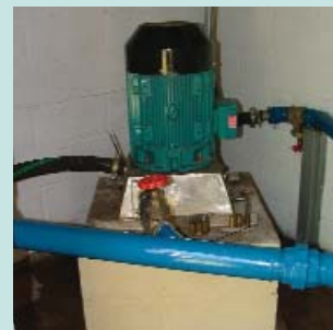
The turbine at Llanover Hydro