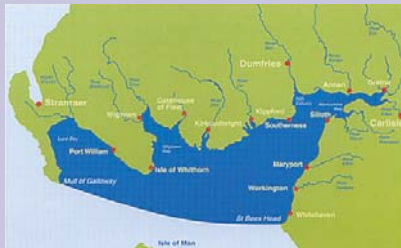
The Solway Firth

The Northwest Regional Development Agency (NWDA) has agreed to commission a £100,000 feasibility study looking into tidal energy options on the Solway Firth.