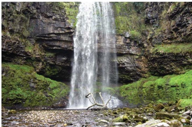
Henhyd Waterfall near Abercraf