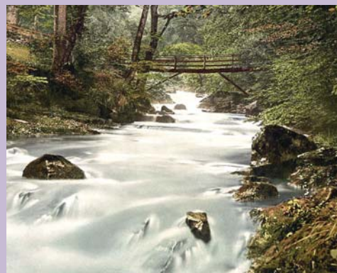
The Birks of Aberfeldy

The proposed scheme would run down Urlar Burn around half a mile from the famous 'Birks falls', down the existing Urlar Road and into the Birks for a turbine situated underground at the car park.