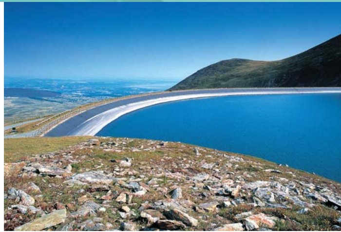
First Hydro - Dinorwig

Two hydropower conferences in as many weeks made October a busy month and one which allowed industry, regulators, government departments and agencies a chance to review progress. Are we going to be able to provide a significant contribution to UK and Europe renewable energy targets? Will we be able to get the best balance between sustainable hydropower generation and the regulatory demands made on us?