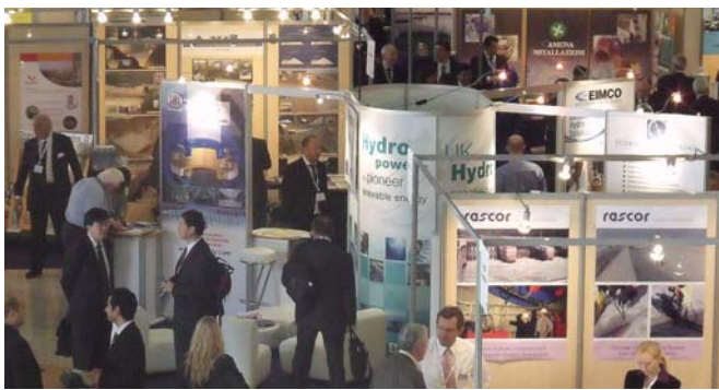
Hydro 2009 Exhibition

The British Hydropower Association's 2009 conference was held in Liverpool. The choice of venue was not made by chance. The Northwest of England and North Wales commands much of the country's pumped storage, storage and run-of-river conventional hydro schemes. The north Irish Sea has a string of tidal impoundment schemes in various stages of study and implementation. It is also one of the best areas for the development of tidal stream generation. Past, present and future hydropower development of all types provided a good platform for a lively conference.